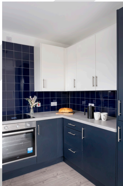
Kitchen, New Build Development