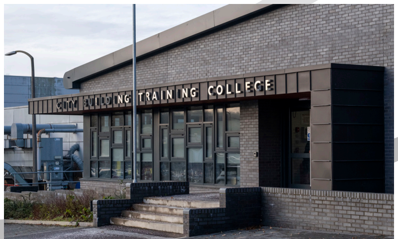
City Building's State-of-the-Art Training College.

Their accreditations include, ISO45001, ISO 14001 and ISO 9001:2015. They are current recipients of a Queen's Award for Enterprise Promoting Opportunity and Investors in Young People Platinum award. Both these accolades recognise their focus on investing in and growing a skilled staff base.